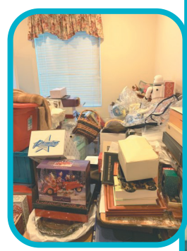
Clutter of donation located in our ADA room for storage.

Hard to list items and find them to ship.