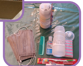
Hygiene items to be given to each Resident entering Precious Life.