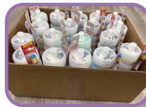
from Seal Beach Girl Scout Troop 3724