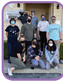
We are grateful to the Give Club from Los Alamitos High School for their day of cleaning around the shelter.