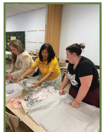
"God's Work Our Hands" of Bethlehem Lutheran Church assembles items collected for layette bags for Precious Life.