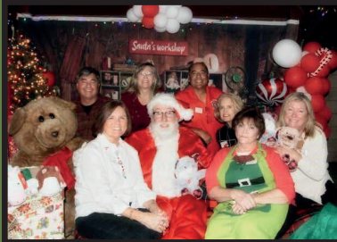
Board of Directors & Staff