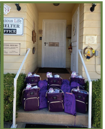
West Cypress Church put together adorable purple layette backpack tote bags for each woman and baby.