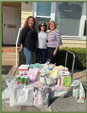
St. Cornelius hosted baby shower for shelter and delivered items to enhance layette bags that each mom receives.