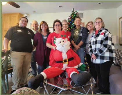
Thank you St. Hedwig Service Day crew for decorating the shelter for the holidays.