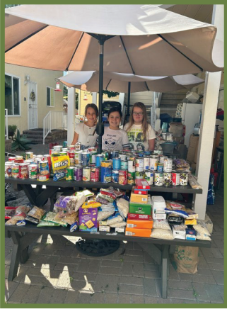
Students from Montessori Greenhouse School deliver canned food collected from annual drive to fill our pantry.