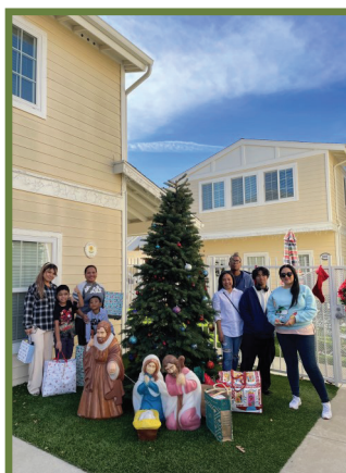
Thank you Gather Church for continuing to provide Christmas gifts to shelter moms and babies.