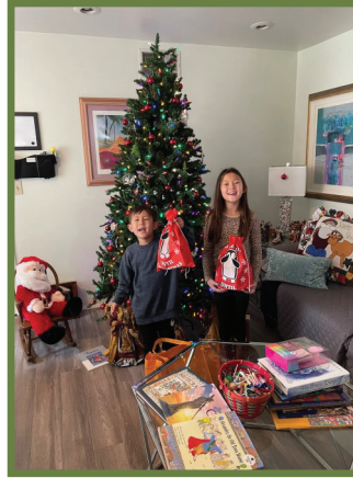
Kids at Winter Wonderland heard about PLS and collected products for shelter.