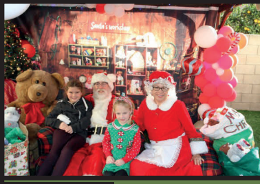
Santa & Mrs. Claus