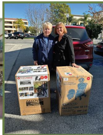
LOTE, women's group of Seal Beach, donated two car seat/stroller sets for our moms.