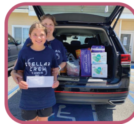
The Kids from St. Hedwig Vacation Bible School collected baby necessities and a monetary donation.