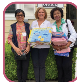
Spring Chickens Quilting Group gifted Precious Life beautiful handmade quilts.