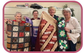
Handmade "Because We Care" quilts made with love by the talented "Grannies" from Walnut Village Retirement Community in Anaheim.