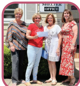
Rossmoor Woman's Club gifting funds to Precious Life.