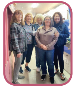
Thank you to the Women's Bible Study Group from Seacoast Grace Church for volunteering at the Thrift Shop each month.