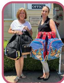
City of Los Alamitos Back Distribution Program provided for our children in our permanent housing.