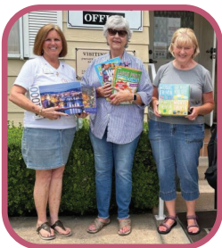
Thank you to the Women of the Lutheran Church of the Good Shepherd, Buena Park for puzzles, games and activity books for the kids. We are also grateful for their continue support in making goodie bags all year for each special holiday