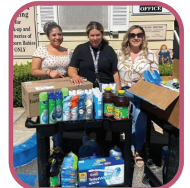
Tru Colors Woman's Group delivered needed cleaning products for the shelter.

We graciously thank donors for their continuing support throughout 2022 Annual Pledge Campaign: