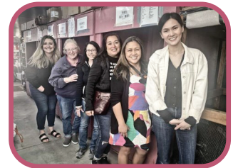
Thank you to Scan Employees Serve Day sorting at the Thrift Shop.