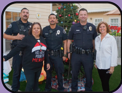
Los Alamitos Police brought blankets to PLS for women and babies and toured the shelter.