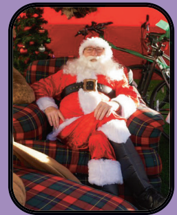
Thanks Santa for taking time out of your busy schedule to visit with our guests.