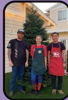
Thank you Los Alamitos Youth Center for gifting and delivering beautiful Christmas Trees.