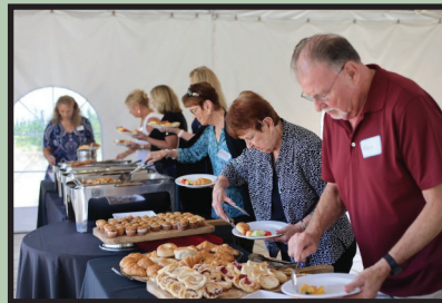
Guests enjoyed a delicious brunch!