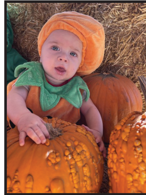
Walter the Pumpkin