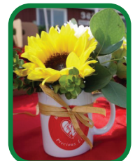
Thank you Trader Joe's of Huntington Beach for gifting the beautiful flowers.