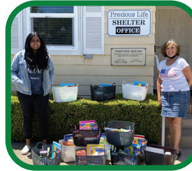
Trisha delivers tote baskets filled with essential items for each resident.